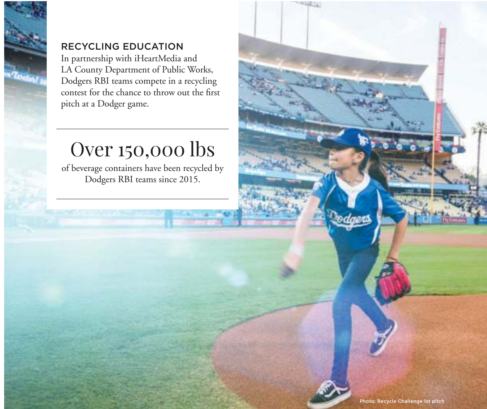
Photo: Recycle Challenge 1st pitch

Over 150,000 lbs of beverage containers have been recycled by Dodgers RBI teams since 2015.